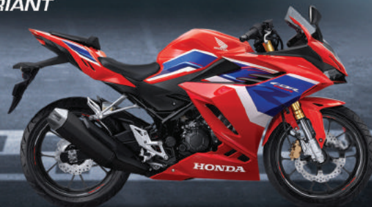
Winning Red (Honda Tri-Color)